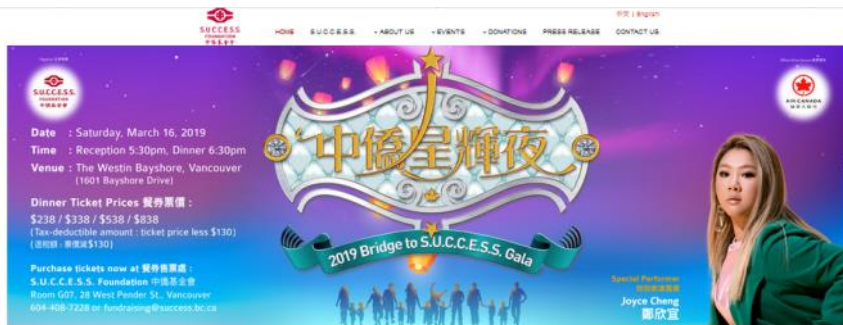
2019 Bridge to S.U.C.C.E.S.S. Gala Saturday, March 16, 2019

A2Z Capital's logo is featured on our Bridge to S.U.C.C.E.S.S. Gala webpage ( https://successfoundation.ca/gala/2019 ) along with a hyperlink to A2Z Capital's website.