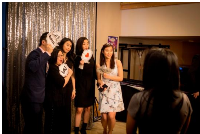
Guests enjoying the photo booth