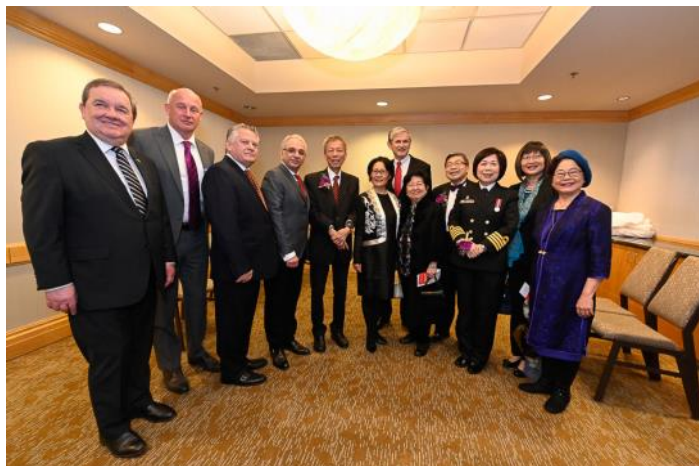
Distinguished guests and government officials attended the gala