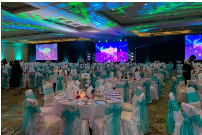
Decorated ballroom in anticipation of 750 guests